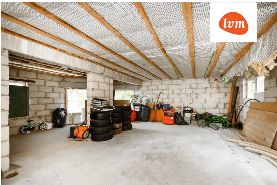
Suvilate tee 22 I korrus