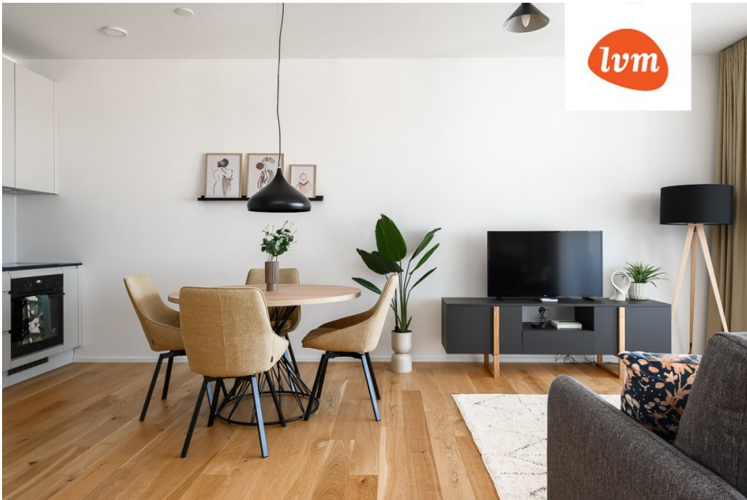
apartment, Ringi 60-44