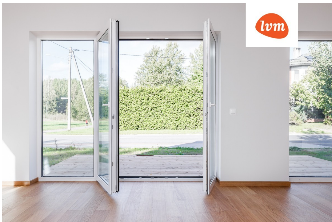
Pallase pst 3 I korrus