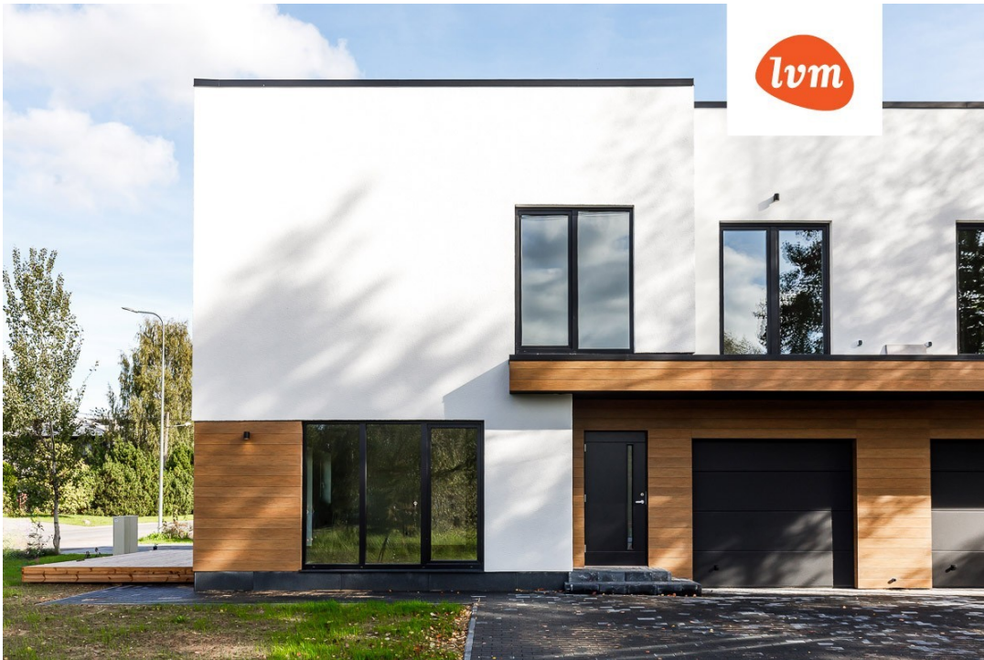
section of house, Pallase pst