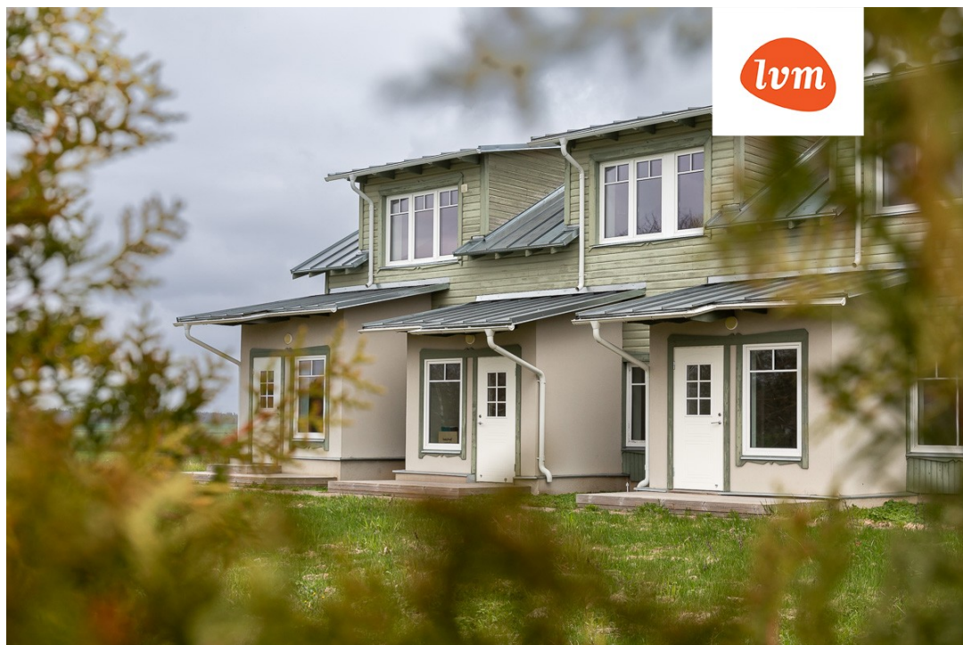
section of house, Oja tee 11a-1