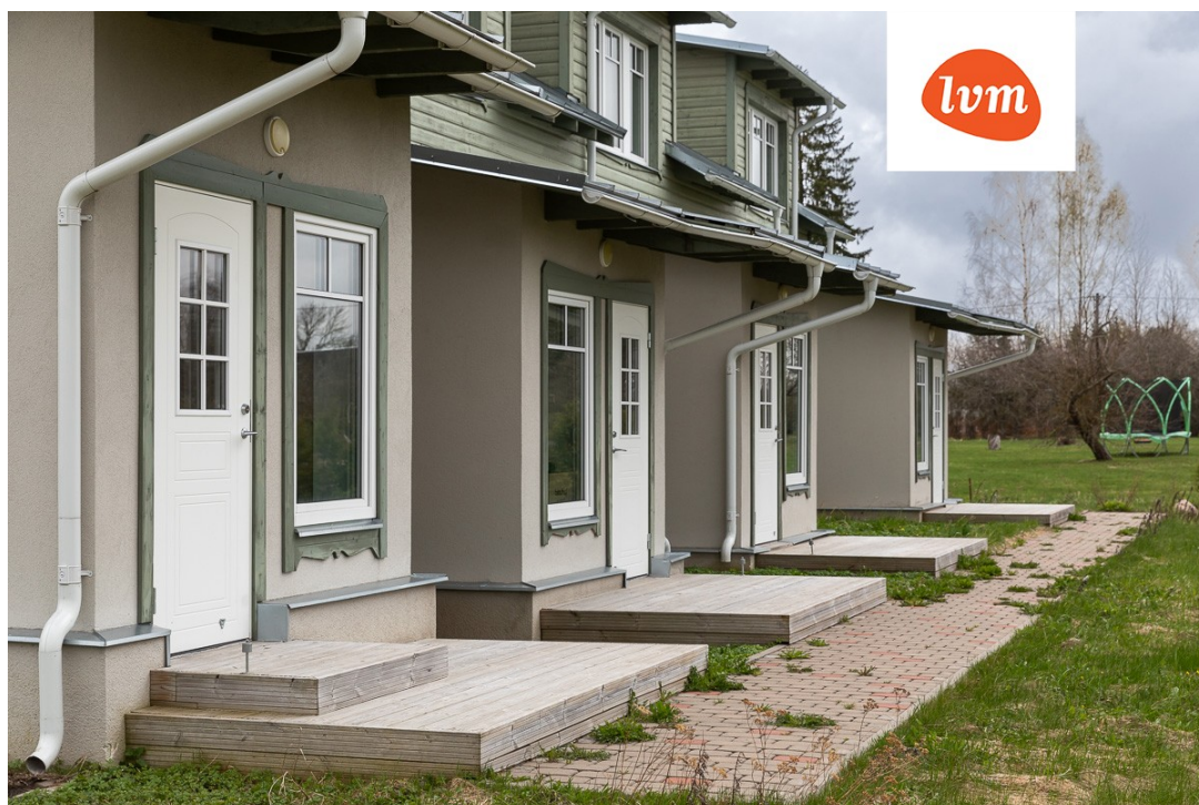
section of house, Oja tee 11a-4