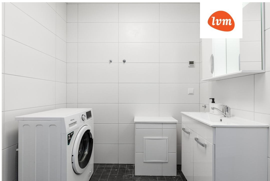
Oja tee 11a Korter 4 I ja II korrus