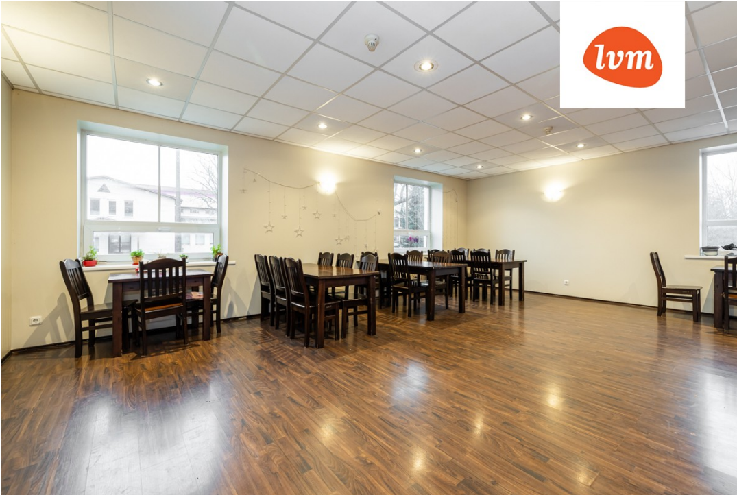
Ardu külalistemaja II korrus