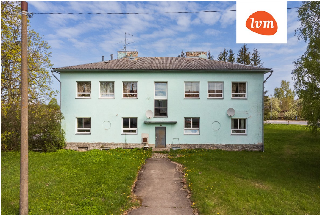
Ardu külalistemaja I korrus