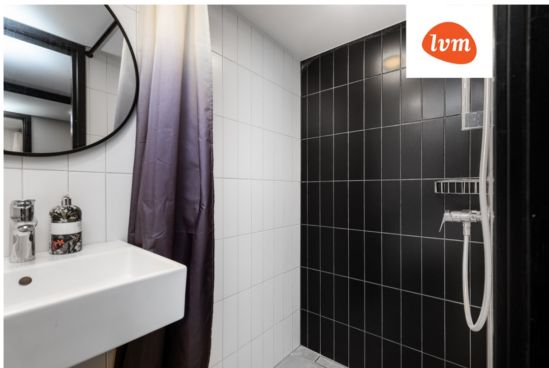
Lai 29, Tartu