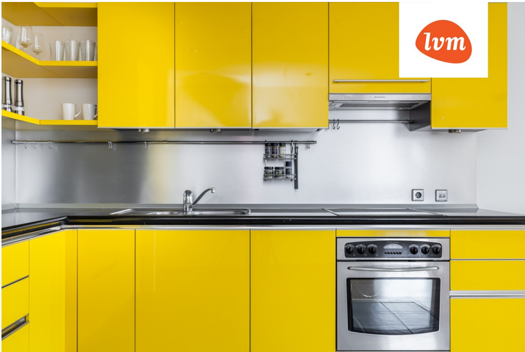
apartment, Tuvi 12/1