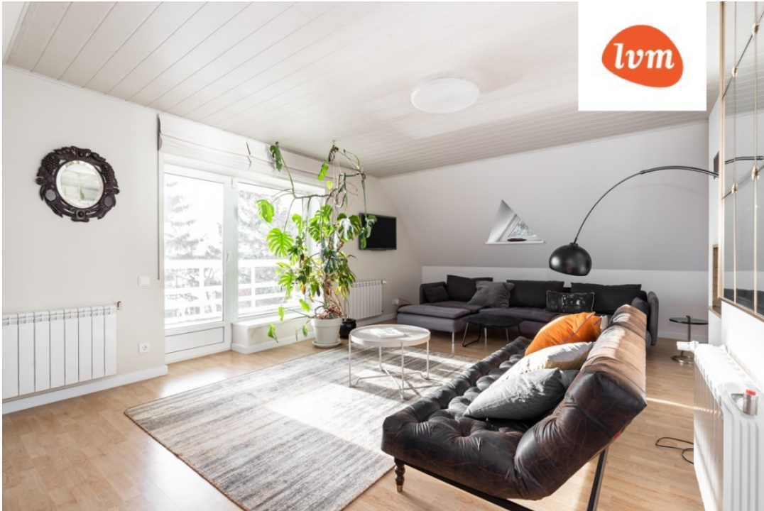
Soolahe tee 29 Katusekorrus