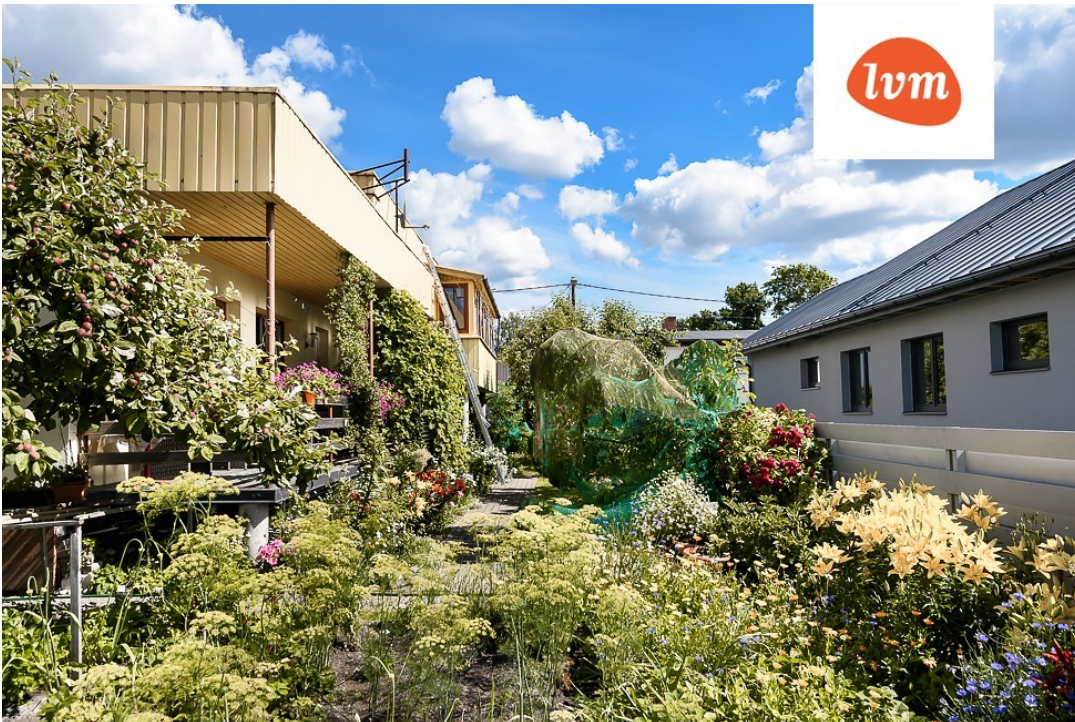
Püssi 12 I korrus