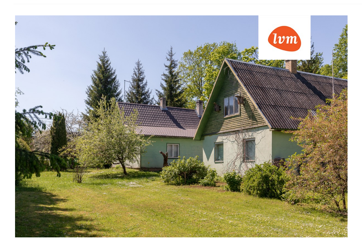
Luha 1 Räpina Elumaja