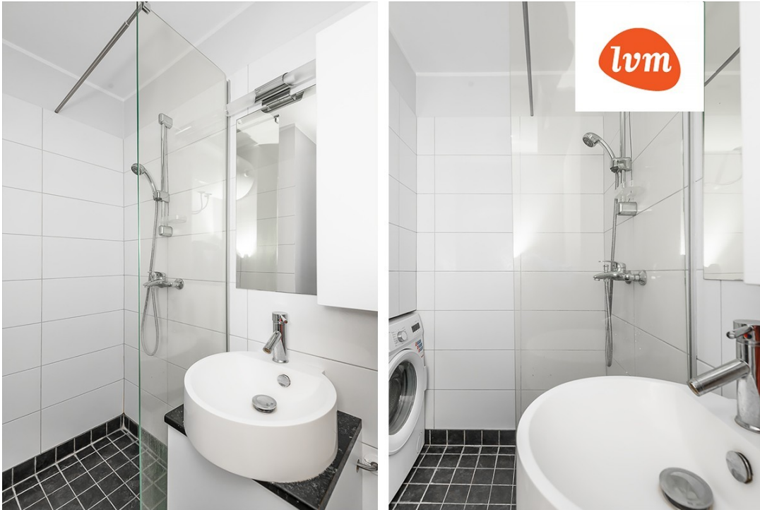
Suur-Kuke 15a 1 tuba, 26.2 m 2