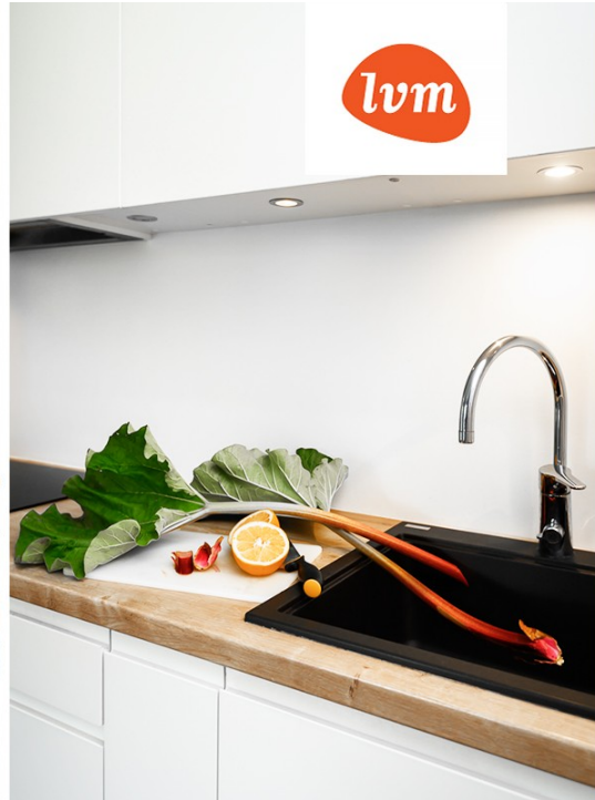
Pihla tee 15 Tahkuranna II korrus