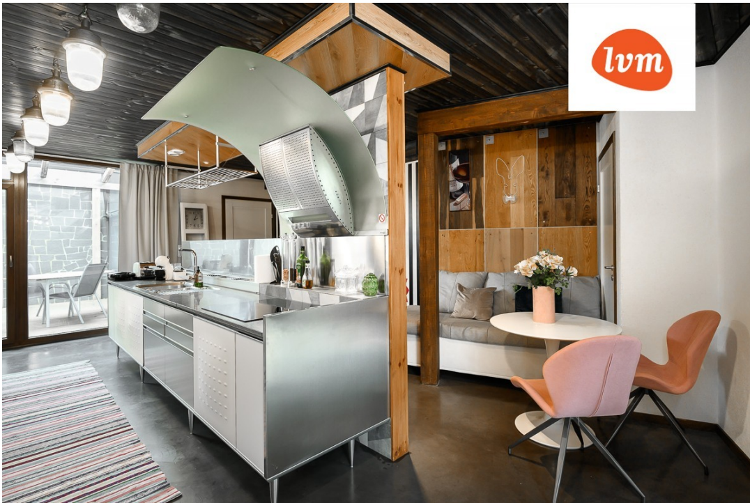
Suur- Kuke 26a I korrus