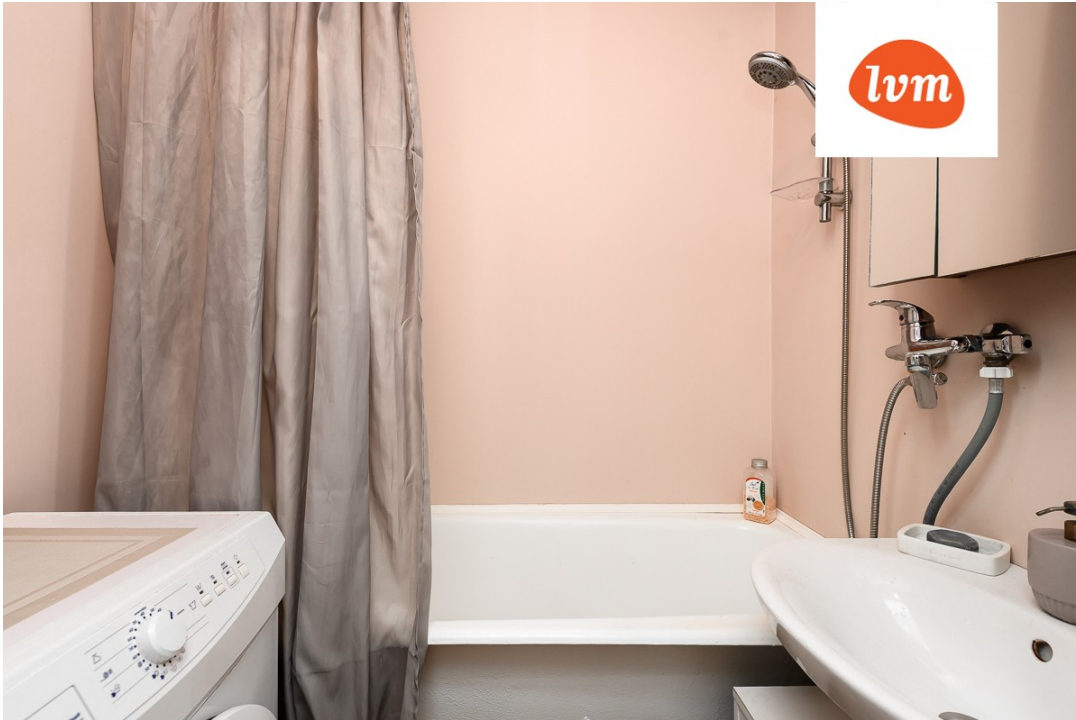
Möisa vkt 5 Uulu