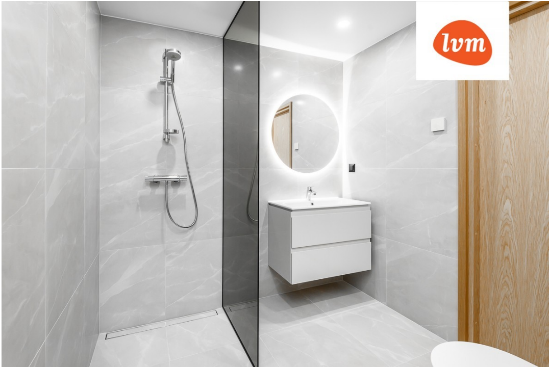
Hirvela 13 Korter 14, 3 tuba, 63,6 m 2