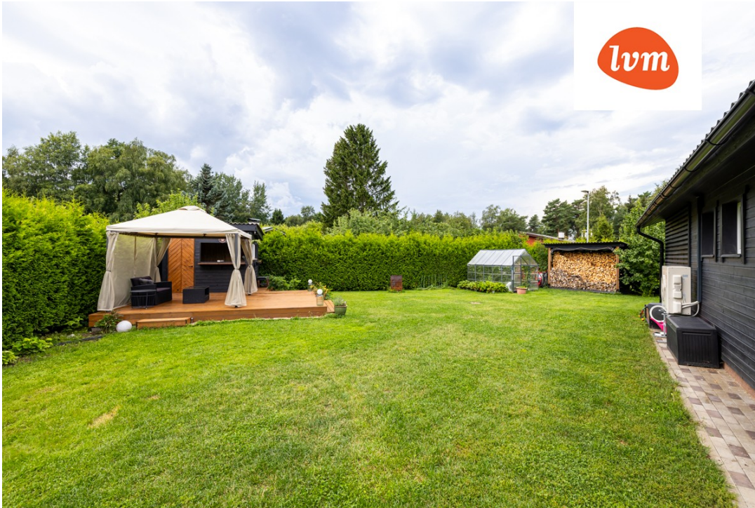
Kasteheina 3 I korrus