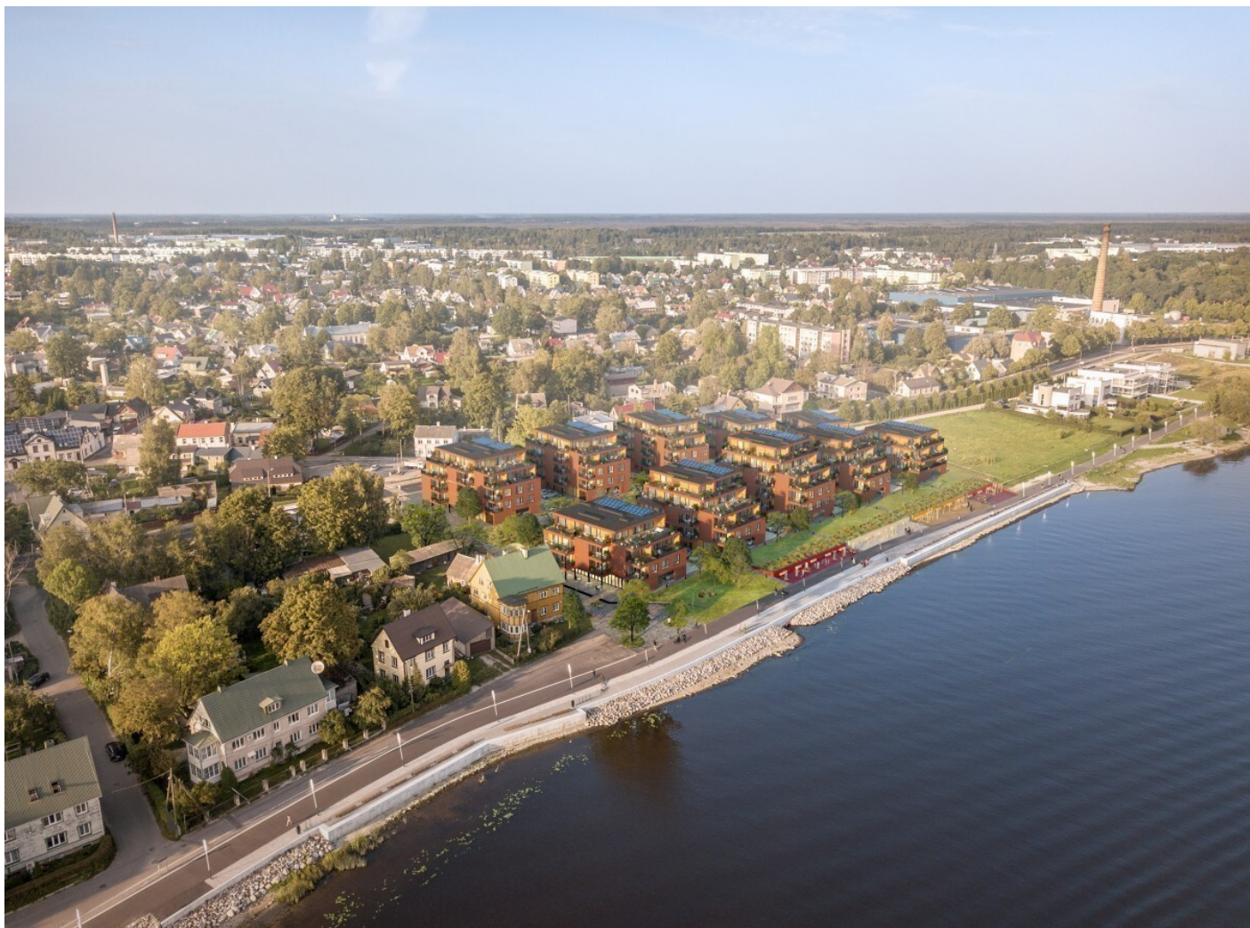
apartment, Rääma tn 7C/1-9