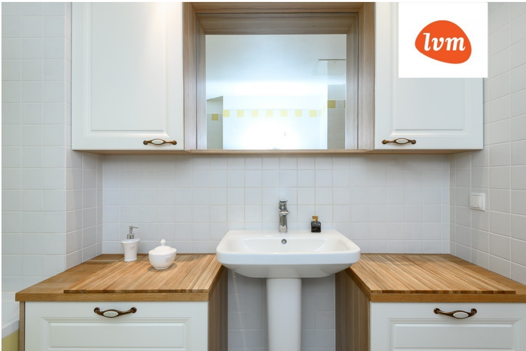
Papli 27 3 tuba, 57.5m 2