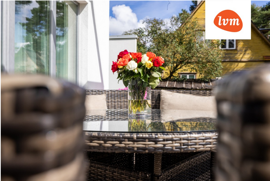
Lemmiku 12b II korrus