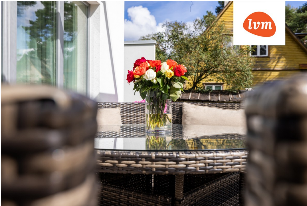
Lemmiku 12b II korrus