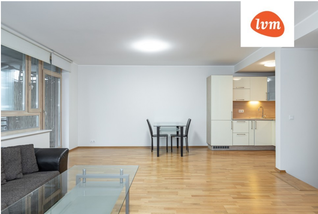
Komeedi 14 I ja II korrus