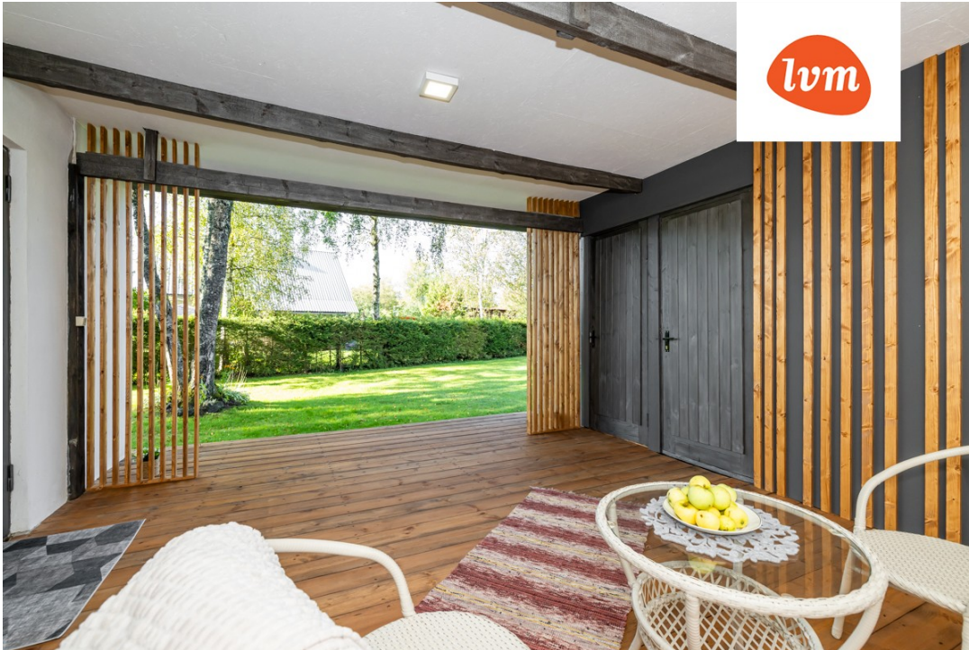
Kapa vkt 58 Aespa I korrus