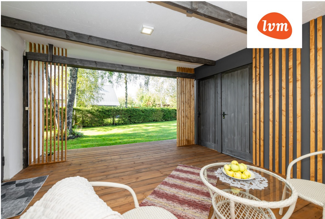
Kapa vkt 58 Aespa I korrus