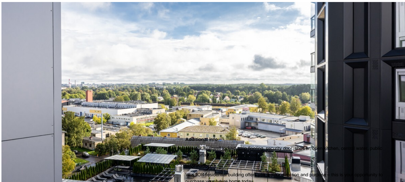
apartment, Pärnu mnt 137