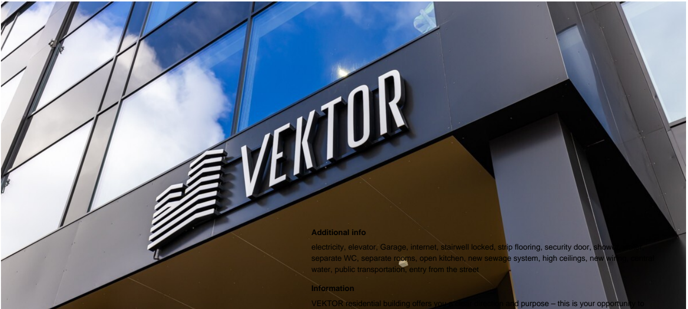
apartment, Pärnu mnt 137