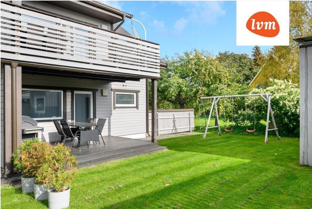
Maarja 16 II korrus