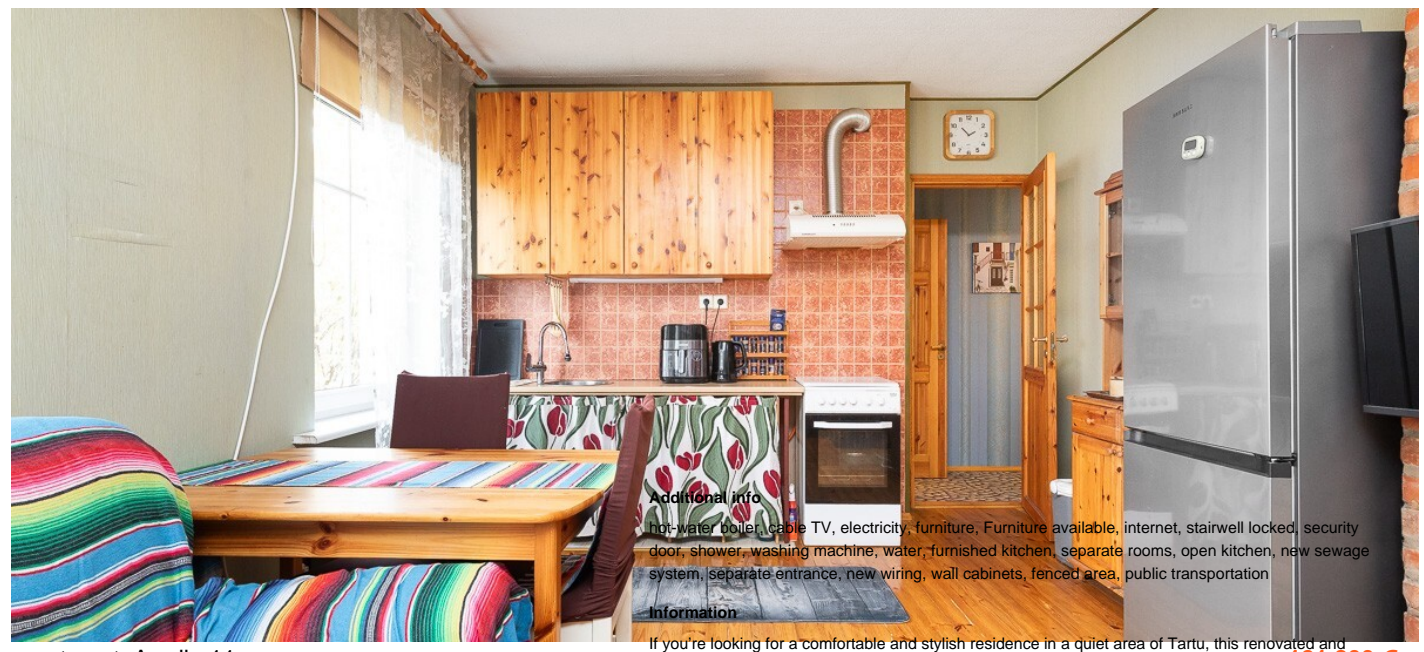
apartment, Aardla 11