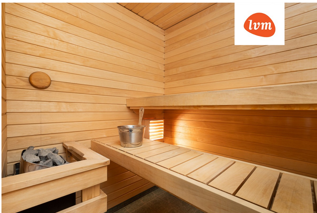
Koovitaja 1 I korrus