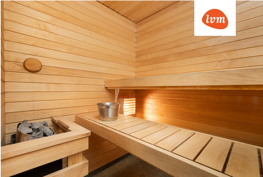
Koovitaja 1 I korrus