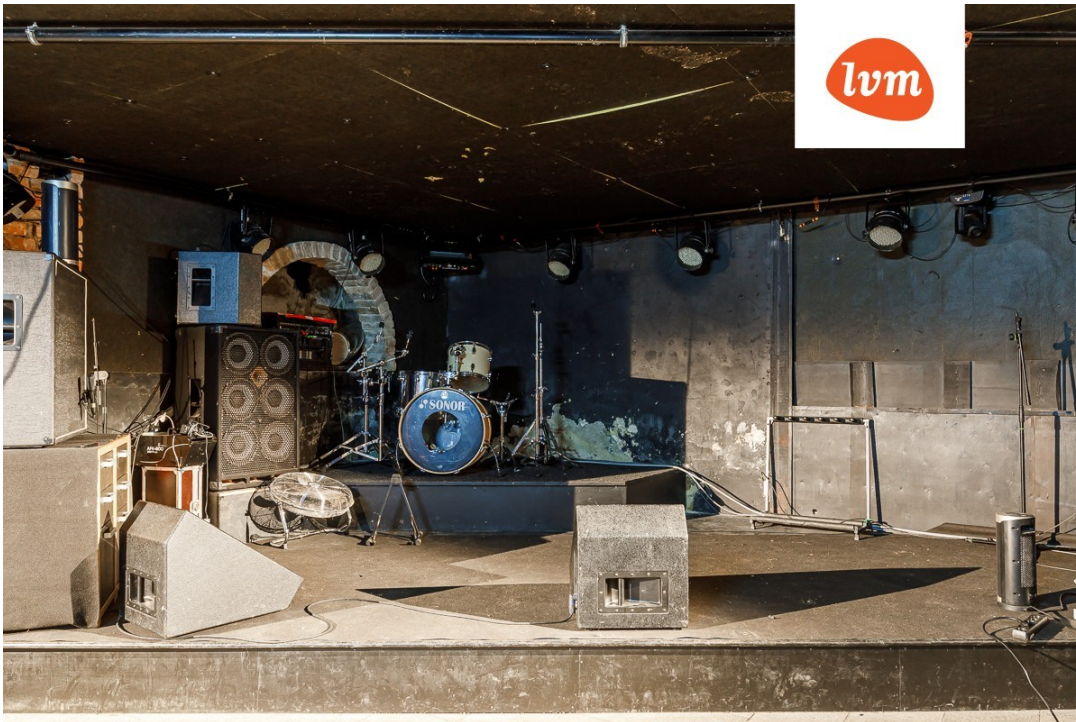
Tiigi 76a Keldrikorrus