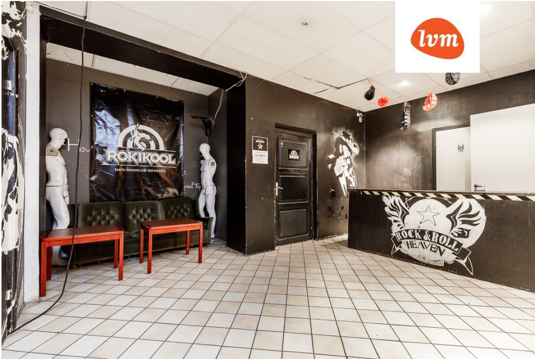
Tiigi 76a II korrus