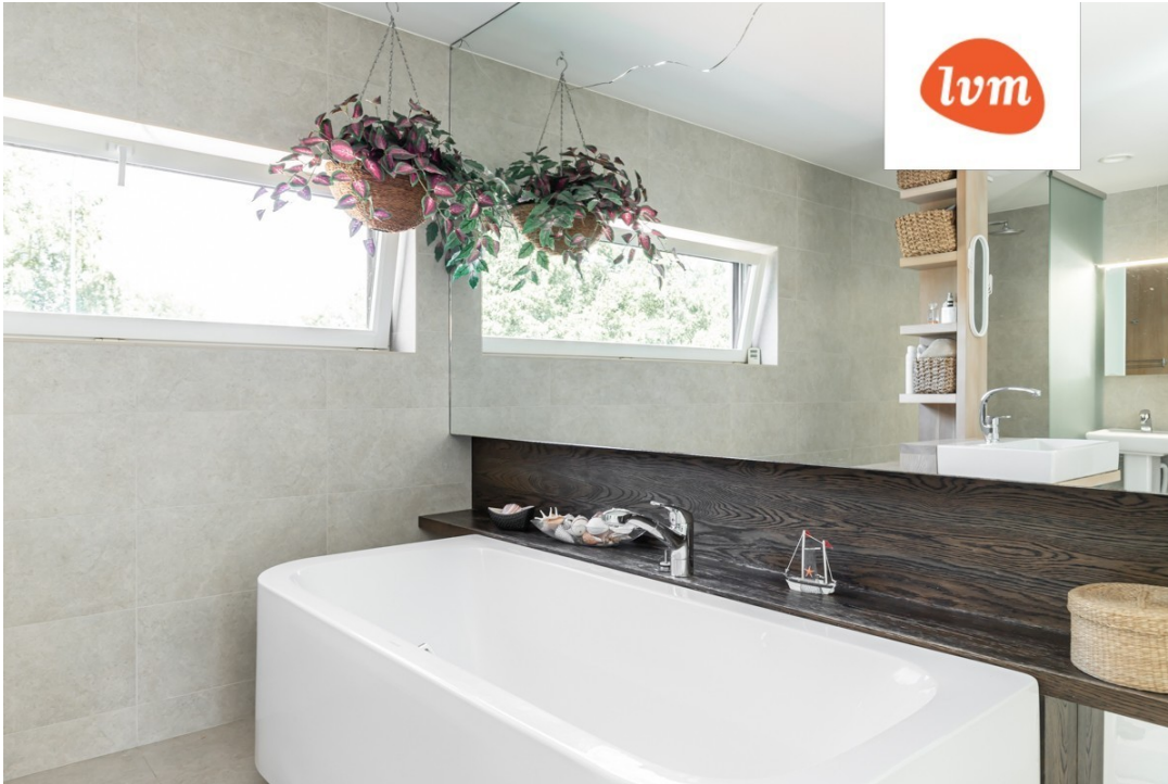
Jõeoti 37 I korrus