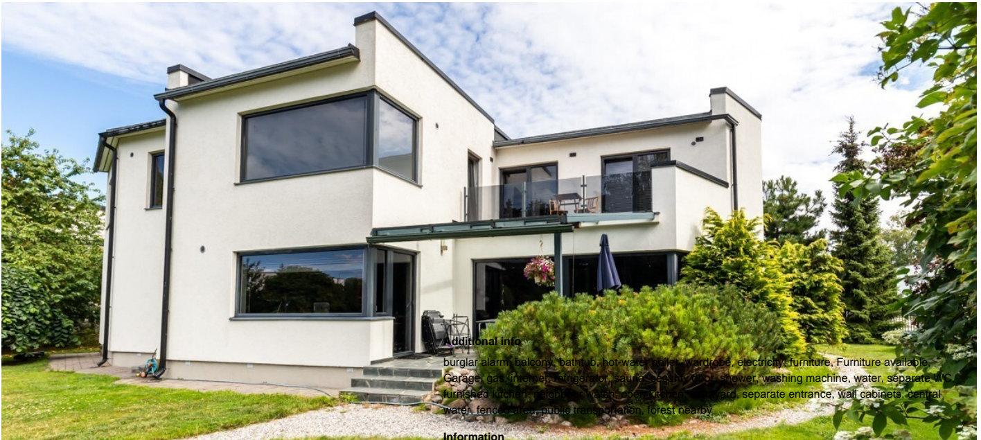
House, Jõeoti 37