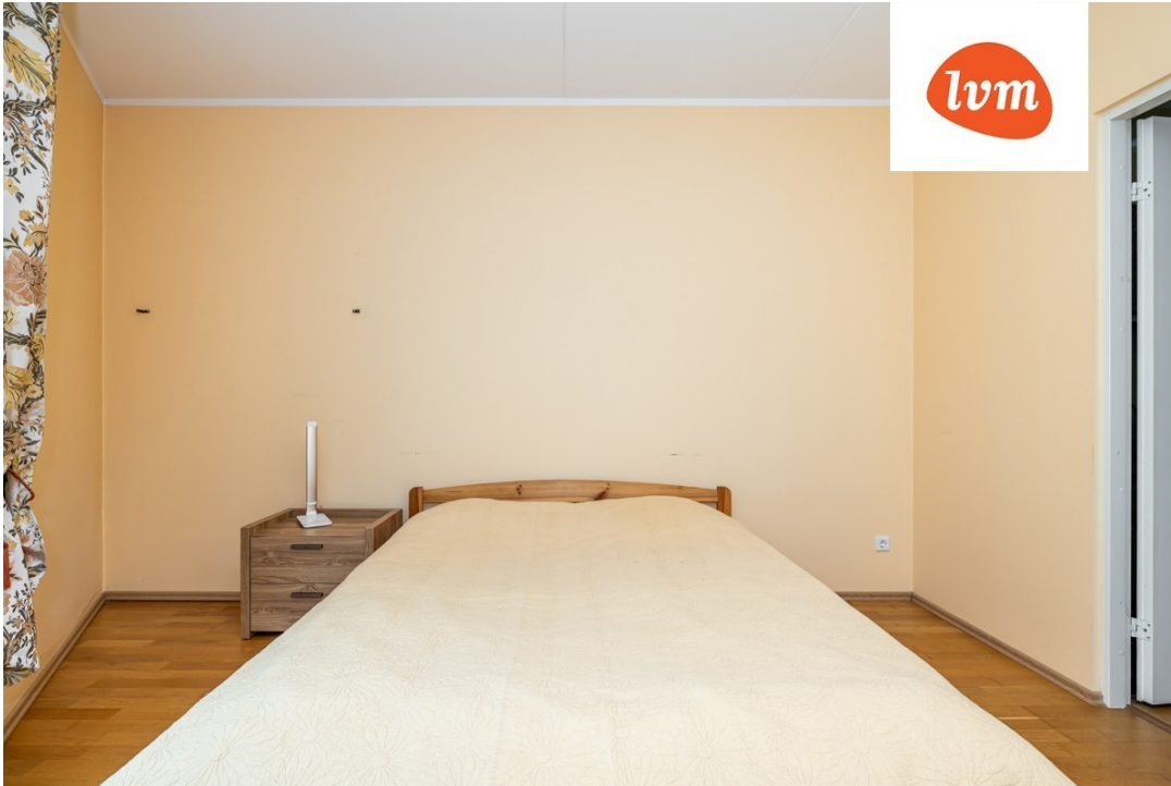
Tähe 105b soklikorras