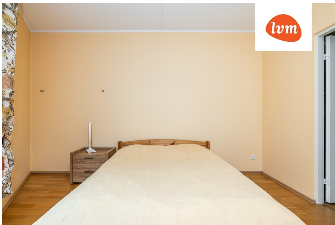
Tähe 105b soklikorrus