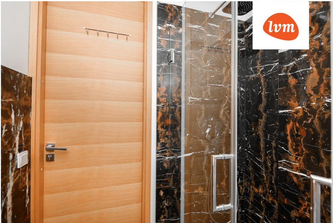
Seedri 4, Pärnu