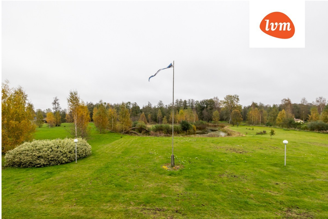
Puuna, Änglema I korrus