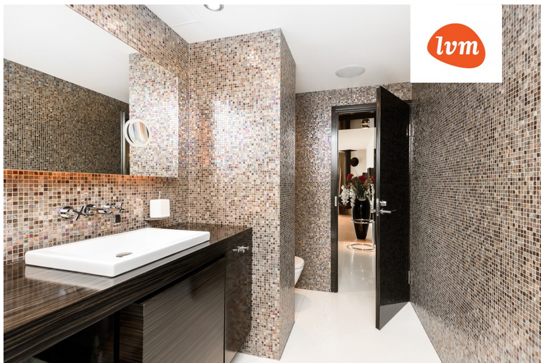
Lehe tn 1, Pärnu