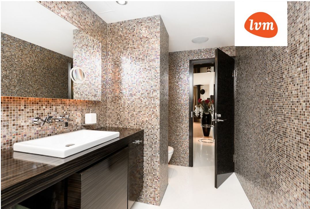
Lehe tn 1, Pärnu