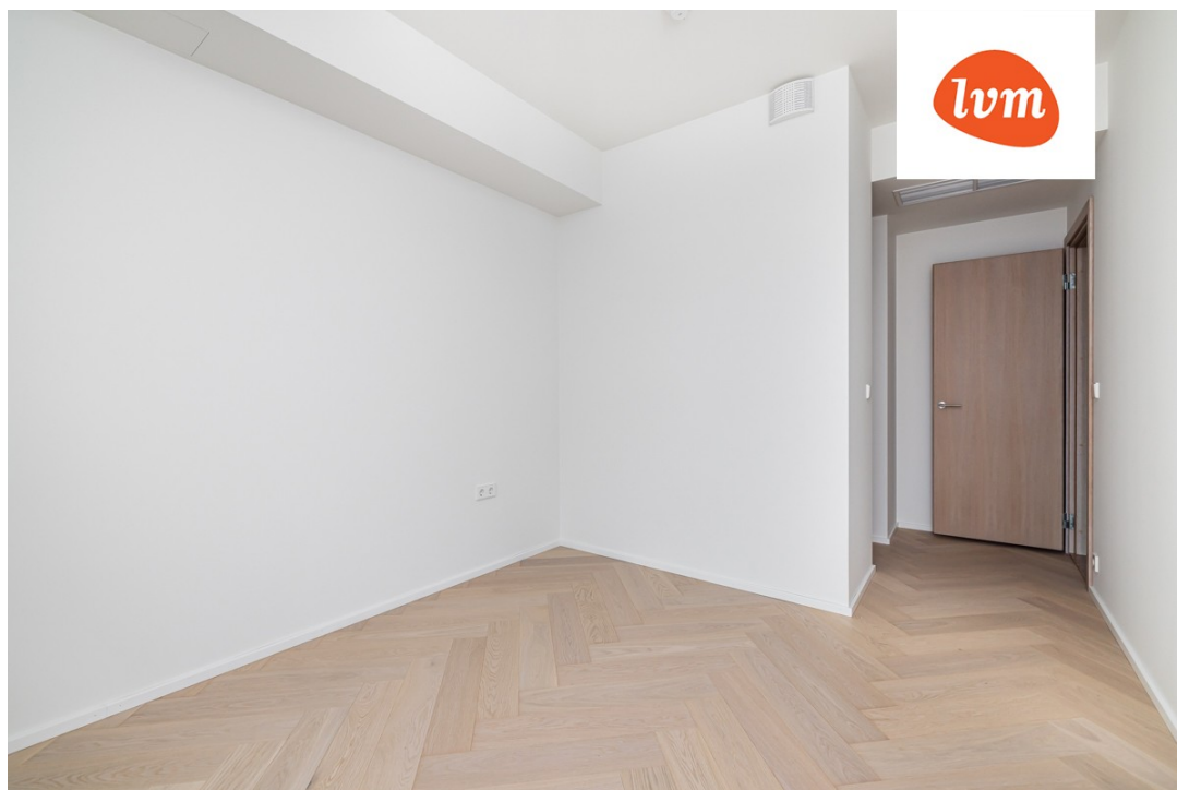
Pärnu mnt 137