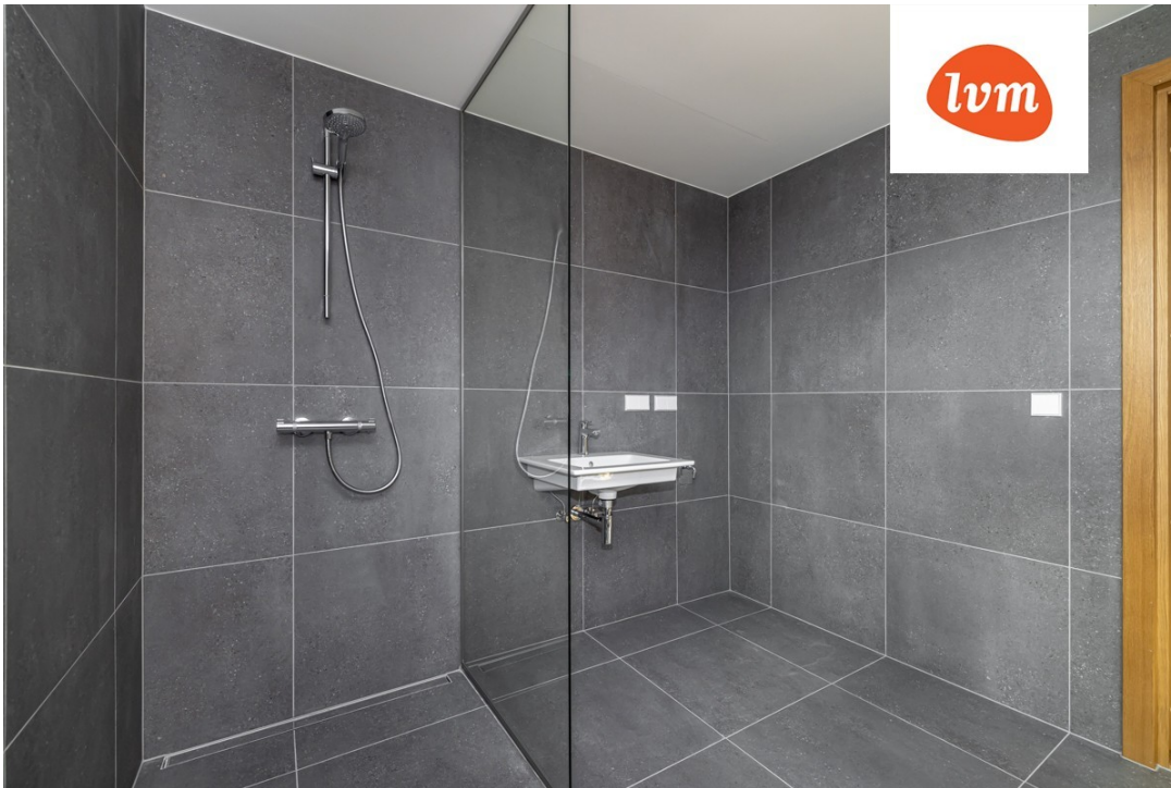
Pärnu mnt 137