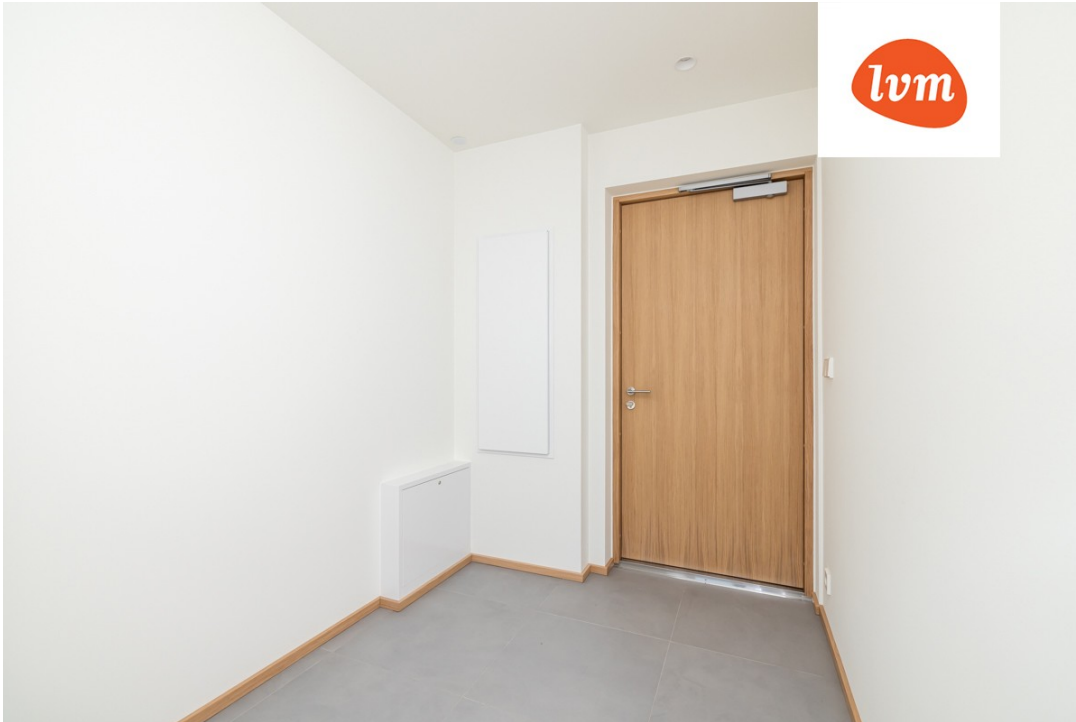
Pärnu mnt 137