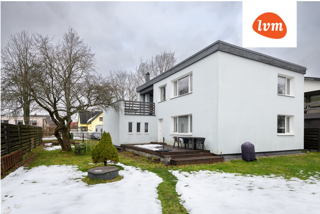
Sakala 4 I korrus