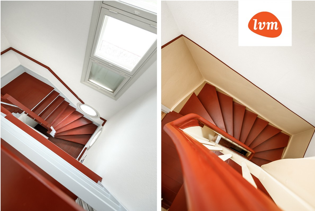
Kuuse 2 II korrus