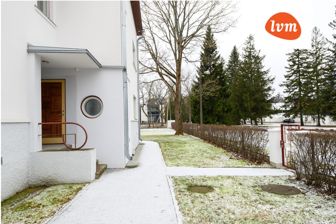
Kuuse 2 Pärnu I korrus