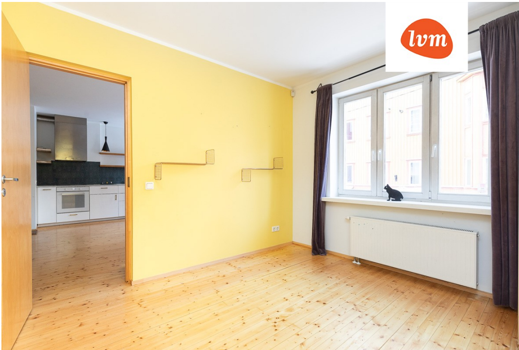
A. Kapi 3 soklikorrus