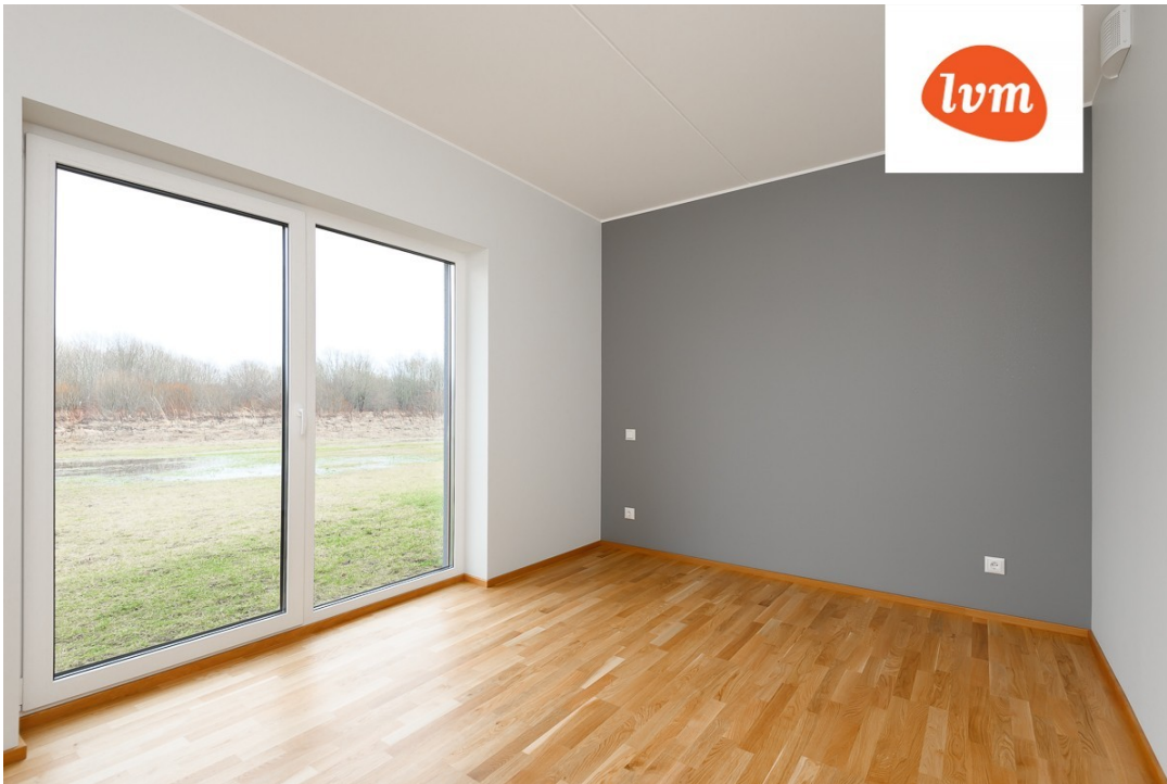
Hirvela 13 Korter 5, 3 tuba, 67,9 m 2