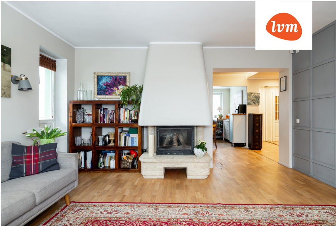
Kaluri tee 4 Põhikorrus