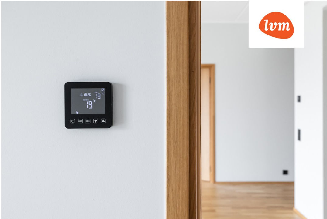
Välja tänav 1/2 Korter 3