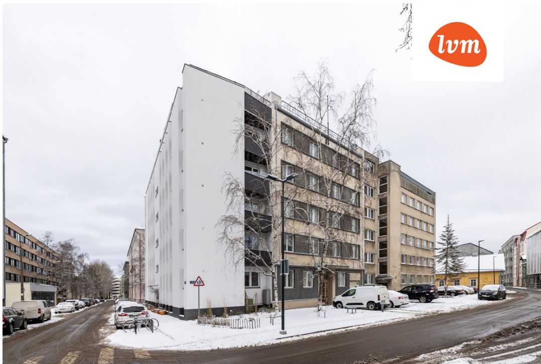
F. R. Faehlmanni tn 17