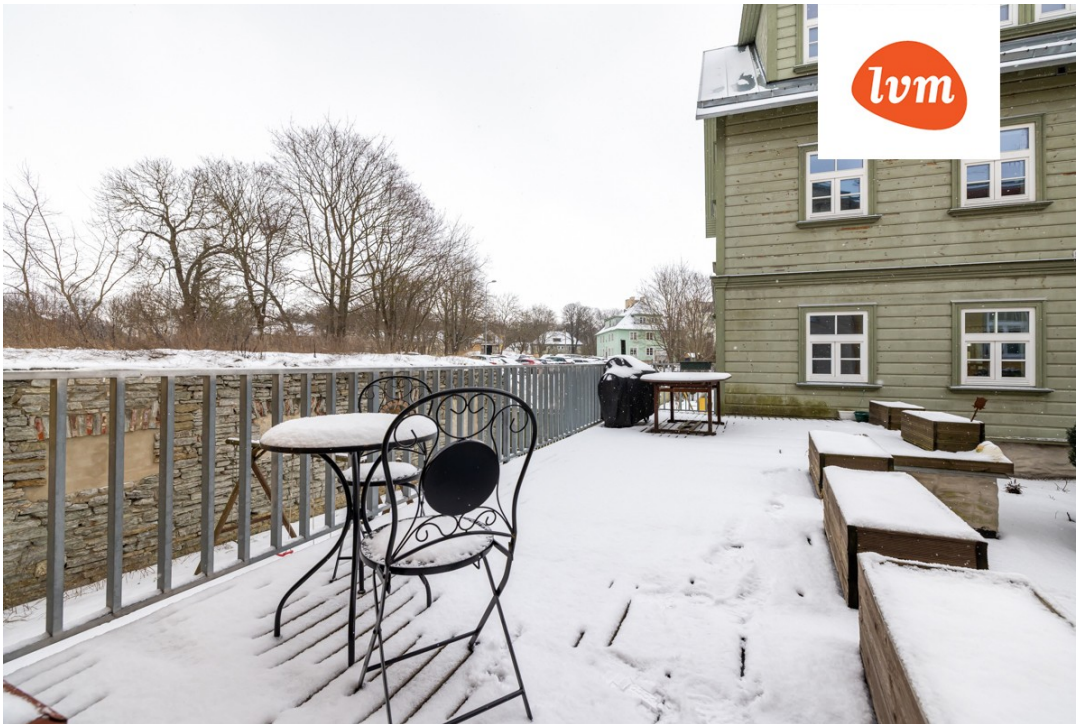
Naeri 5 I korrus