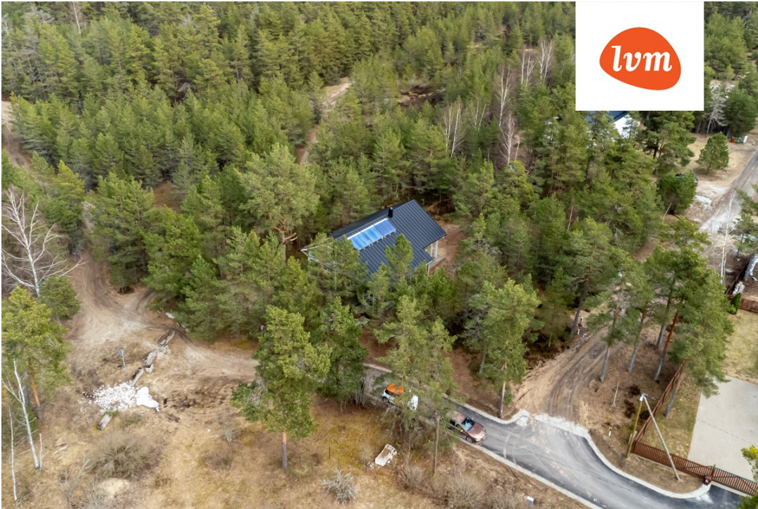
Kuldre tee 1 I korrus