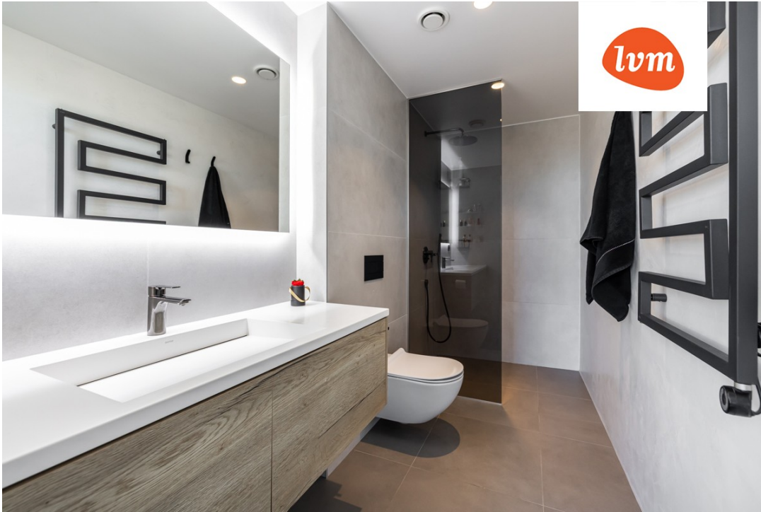
Paevälja tee 8 Katuseterrass