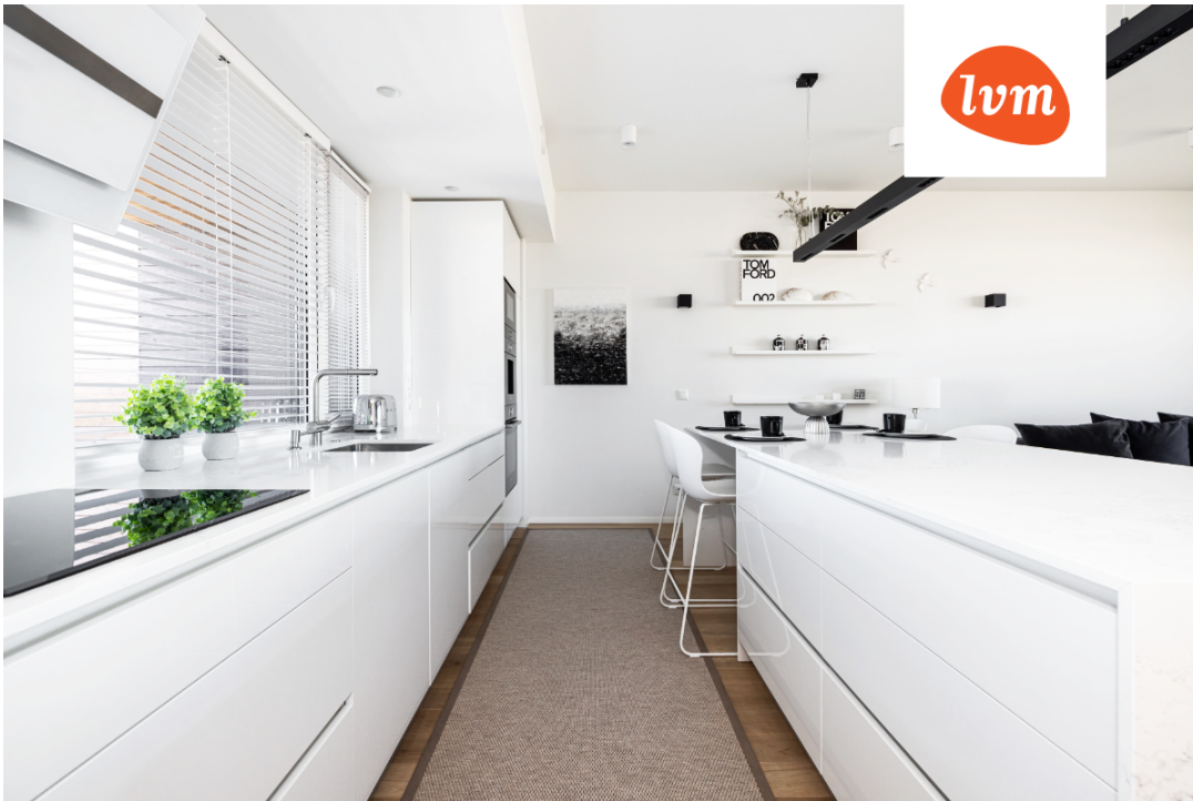
Paevälja tee 8 I korrus