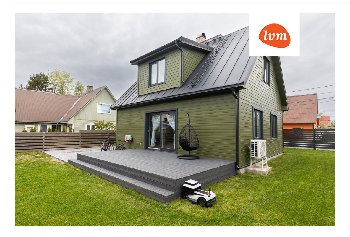
Merimetsa 41 I korrus