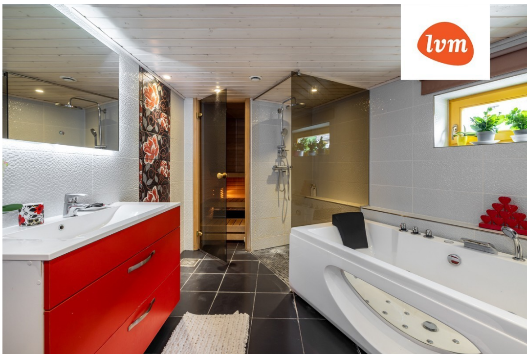
apartment, Tähe 105b