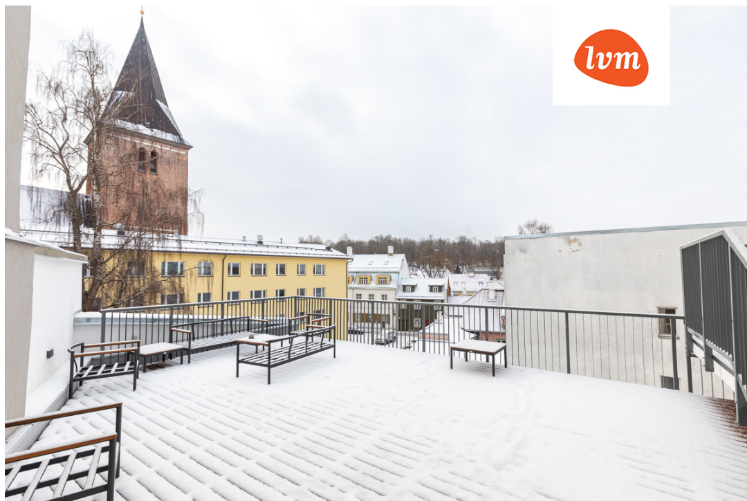
apartment, Lai 29