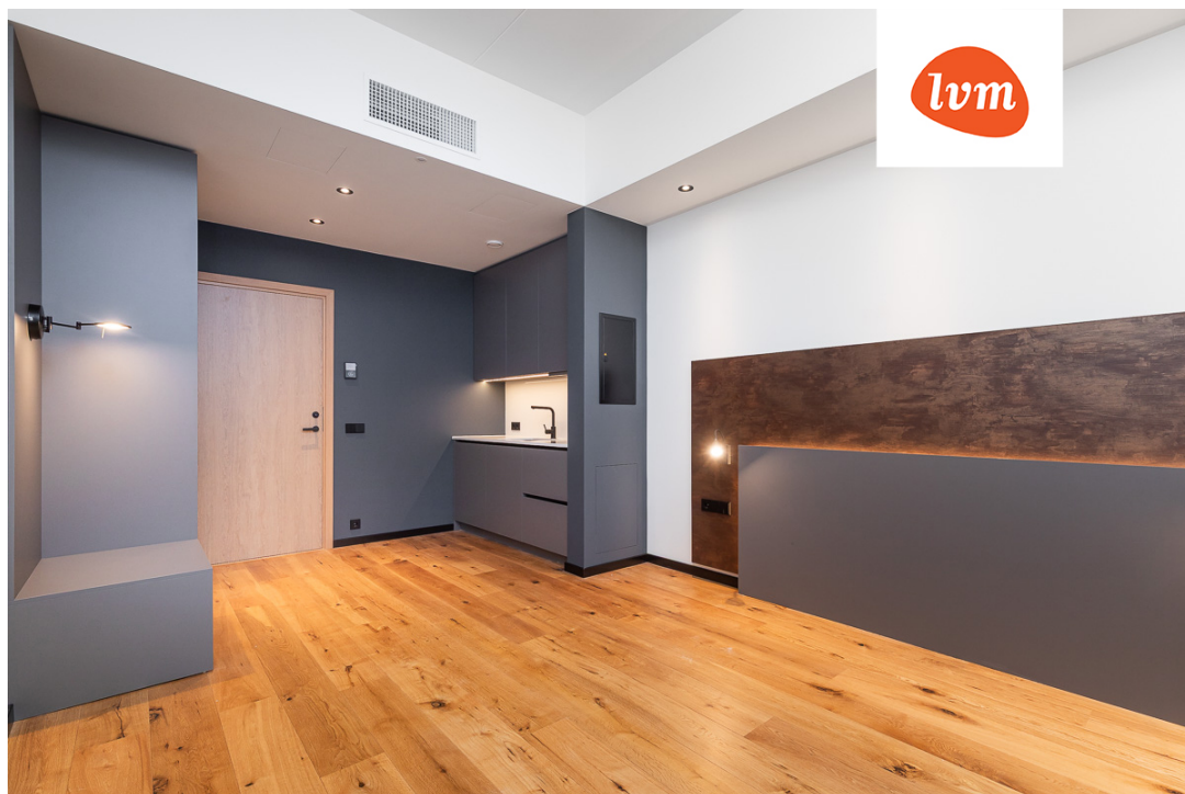
apartment, Teguri 32-28